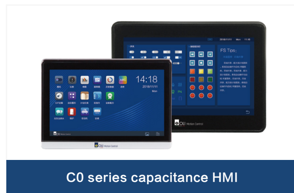
C0 series capacitance HMI